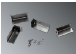
051138 Set of brackets to plasterboard BARBET/3